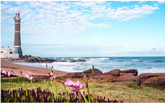
Punta del Este