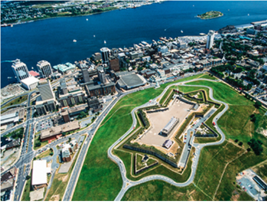
Lexington and Concord