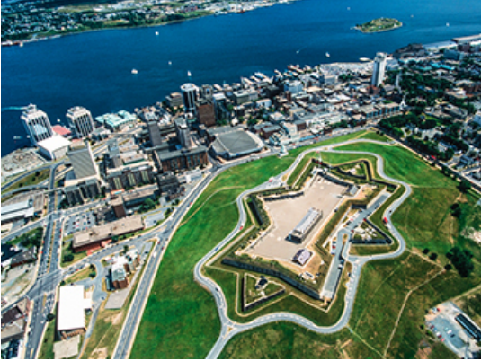
Lexington and Concord