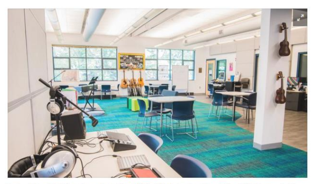
Vantage Deluxe World Travel's recent donation of $1.75 million helped fund the addition of 11,000 square feet in operational space at the West End House, including a new college & career center and high school lounge; expanded kitchen and café; arts wing; and a music clubhouse, pictured here.

Vantage has been a supporter of the West End House since 2000, contributing more than $7 million through corporate donations and fundraising events, according to Thursday's announcement. Vantage's past contributions included all-expense trips to France for 22 West End House teens and alumni and annual sight-seeing trips to Martha's Vineyard; paid internships for teens and alumni; and in-kind donations including annual holiday donations of 1,000 turkeys for local families and tickets to sporting events.