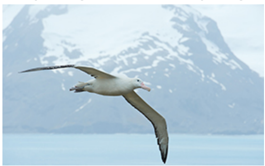
Keep your eyes open as you cruise the coasts of Patagonia and Tierra del Fuego for a variety of pelagic birds