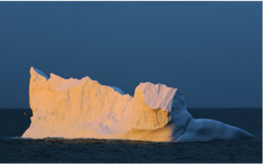
Earn your badge of honor as you cross this legendary passage — and expeditionary rite of passage