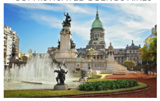
Discover elegant architecture and the passionate tango in cosmopolitan Buenos Aires