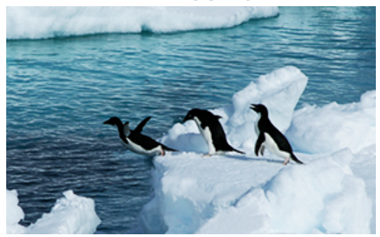
Learn about up to four different species of penguins, which have little fear of humans and often come right up to you