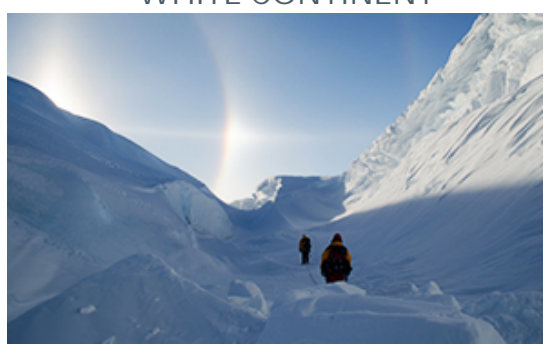
Spend four days exploring the Antarctic Peninsula alongside a knowledgeable Expedition Team