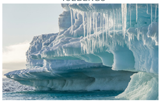
Get up close to icebergs in your nimble Zodiac landing craft