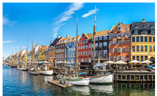
Tour delightful Copenhagen, home of the Little Mermaid, Tivoli Gardens, and inviting districts perfect for strolling