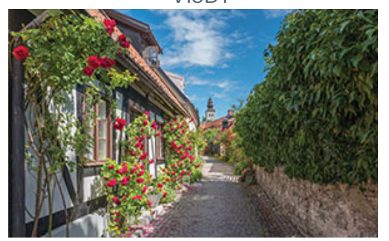
Step back in time on your visit to Visby, the medieval island port that formed a key link in the powerful Hanseatic League trading empire