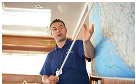
Gain deeper insights into your destinations with talks and discussions by an onboard Resident Lecturer