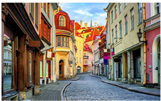
Feel the magic of Tallinn, northern Europe's best-preserved medieval city, as you explore the Upper and Lower towns