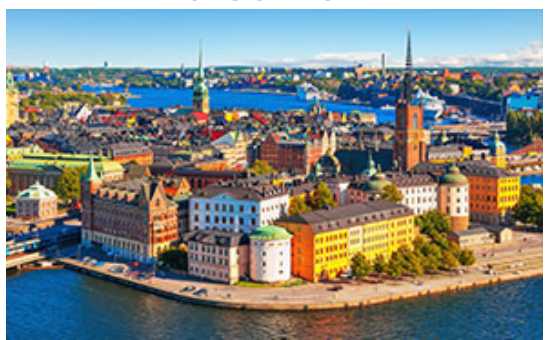
Explore Stockholm, a charming city built on 14 islands connected by more than 57 bridges