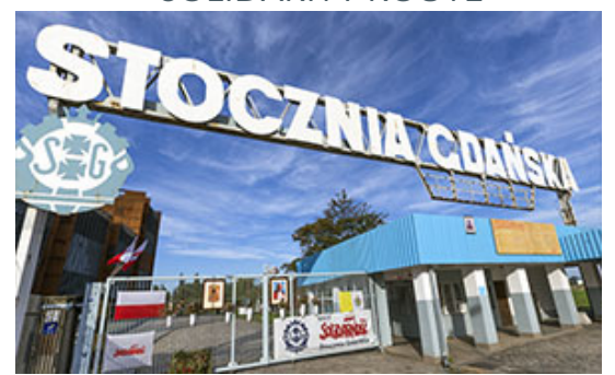
Learn how the shipyards of Gdask gave birth to Poland's legendary Solidarity movement