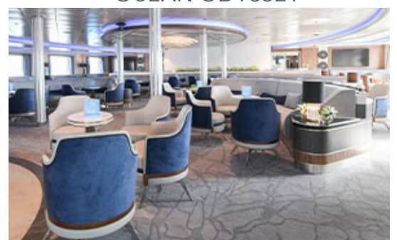
Discover Northern Europe on the Ocean Odyssey