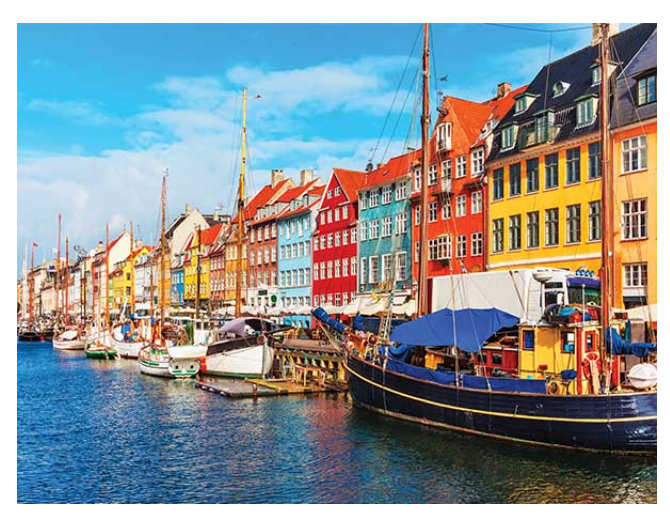
DAY 1: Board an overnight flight to Copenhagen

Today you'll board an overnight flight to Denmark. Or, depart earlier for your preextension to Copenhagen.