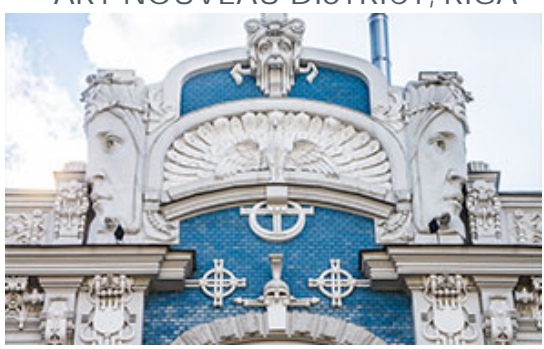
Discover the world's greatest collection of art nouveau architecture on your tour of Riga, Latvia's capital