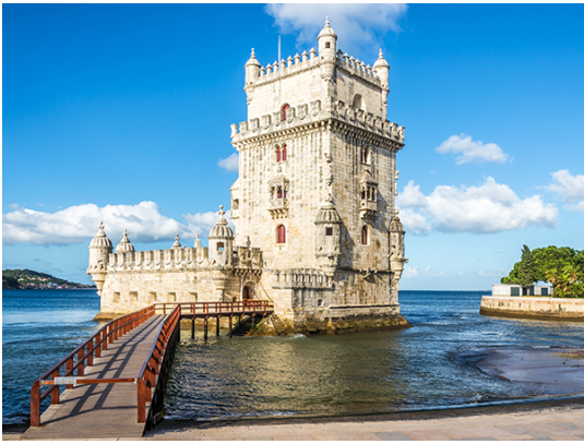
UNESCO World Heritage Site