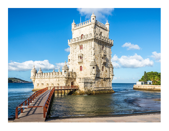
UNESCO World Heritage Site