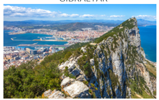
Experience the British side of Spain in Gibraltar