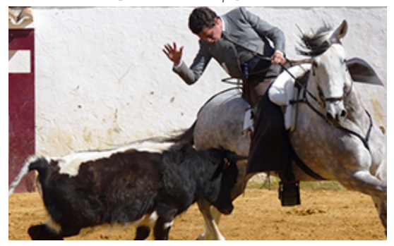
Visit a local bull farm in Seville and enjoy a home-hosted meal