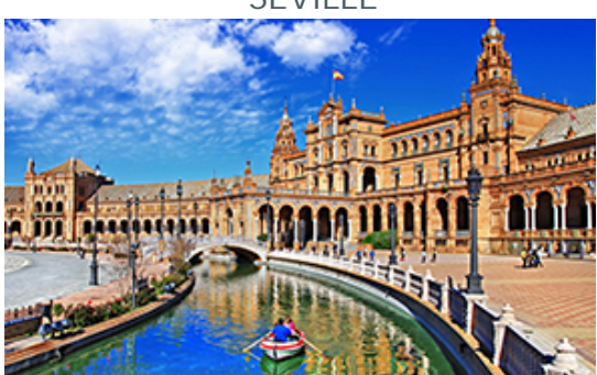
Explore the historic sites of Seville, from the famed Spanish Steps to the UNESCO-listed Seville Cathedral