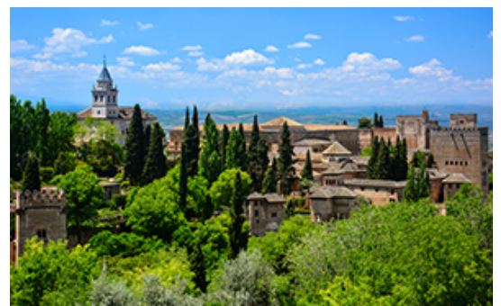
Explore the last stronghold of Moorish Spain at this UNESCO-listed complex of palaces, gardens, and fortified ramparts