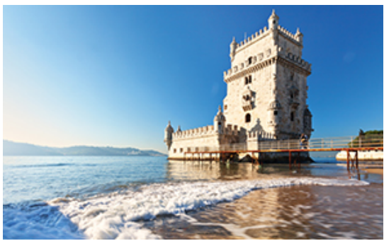
Discover Portugal's capital city with visits to UNESCO-listed Jerónimos Monastery and Belém Tower