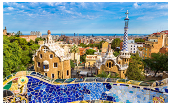
Experience sophisticated Barcelona, as well as the architecture of Antoni Gaudí