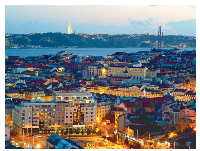
DAY 1: Board an overnight flight to Lisbon, Portugal

Today you'll board an overnight flight to Lisbon. Or, depart earlier for your pre-trip extension in Madeira.