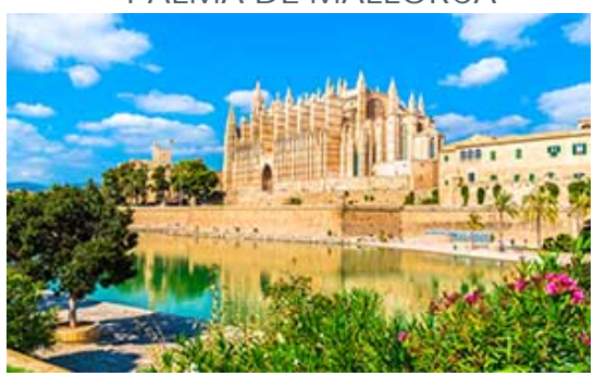
Explore the lush island paradise of Mallorca, ringed by pristine crescent beaches