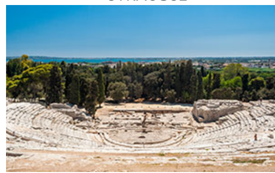
Discover UNESCO-listed Syracuse, where Greek ruins and Italian charm merge