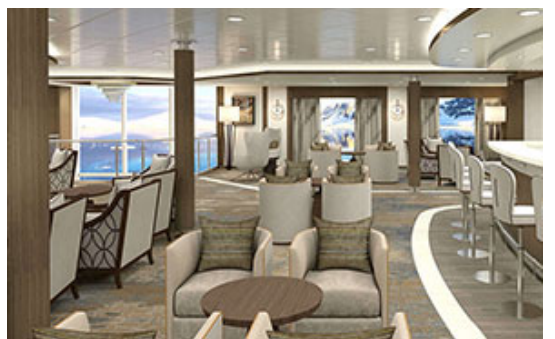
Discover the splendor of the Mediterranean aboard the 5-star Ocean Odyssey