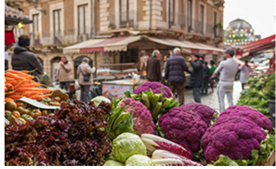
Embark on a fascinating walking tour of Palermo, the capital city of Sicily