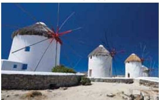
Take a panoramic tour of Mykonos, with a stop for Greek meze (small plates) and ouzo