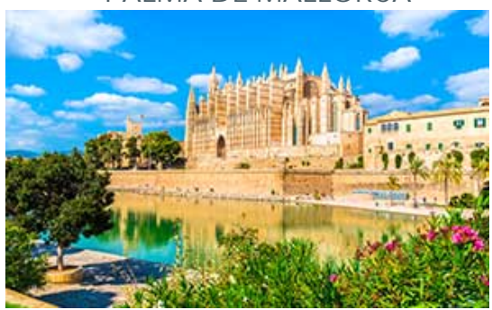
Explore the lush island paradise of Mallorca, ringed by pristine crescent beaches