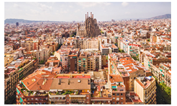
Experience sophisticated Barcelona, as well as the architecture of Antoni Gaudí