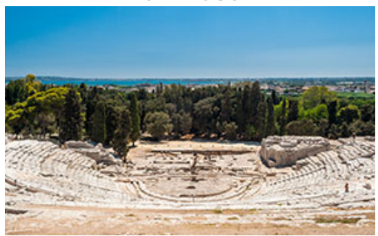
Discover UNESCO-listed Syracuse, where Greek ruins and Italian charm merge