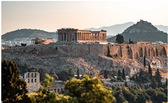
Climb to the apex of the Acropolis, perched on a hill overlooking Athens