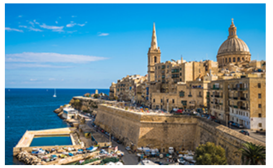
Go sightseeing in Valletta, the capital of Malta and a UNESCO World Heritage Site