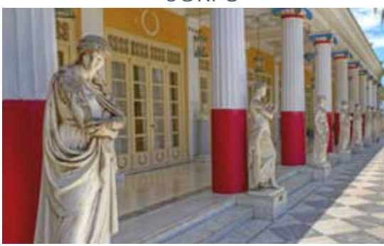
Enjoy a splendid day on this scenic island, a UNESCO World Heritage Site adorned with Venetian inspiration the glittery isle of Santorini, where bonewhite homes overlook the caldera