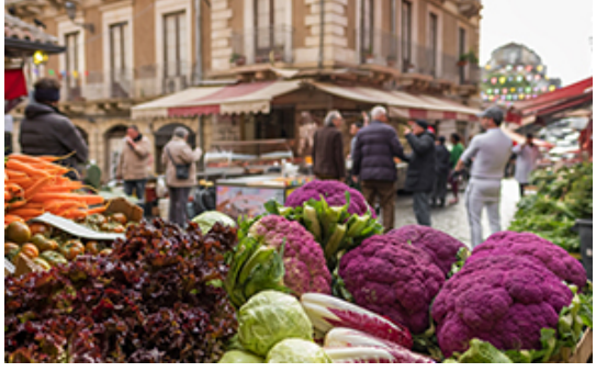
Embark on a fascinating walking tour of Palermo, the capital city of Sicily