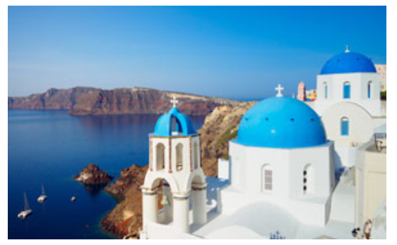
Tour the glittery isle of Santorini, where bone-white homes overlook the caldera