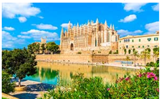
Explore the lush island paradise of Mallorca, ringed by pristine crescent beaches