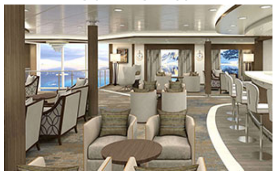
Discover the splendor of the Mediterranean aboard the 5-star Ocean Odyssey