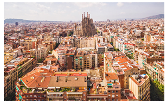
Experience sophisticated Barcelona, as well as the architecture of Antoni Gaudí