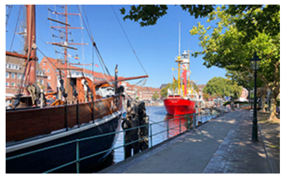
Get to know this tiny 8th-century seaport located in Germany's East Frisian region