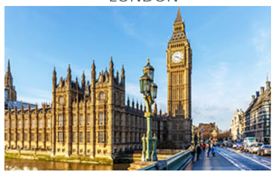
View London's most notable landmarks, including Buckingham Palace and Big Ben, on a guided sightseeing tour