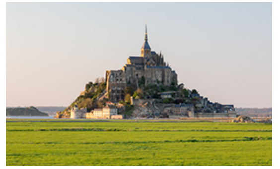
Visit this historic French port and the Benedictine abbey Mont-Saint-Michel