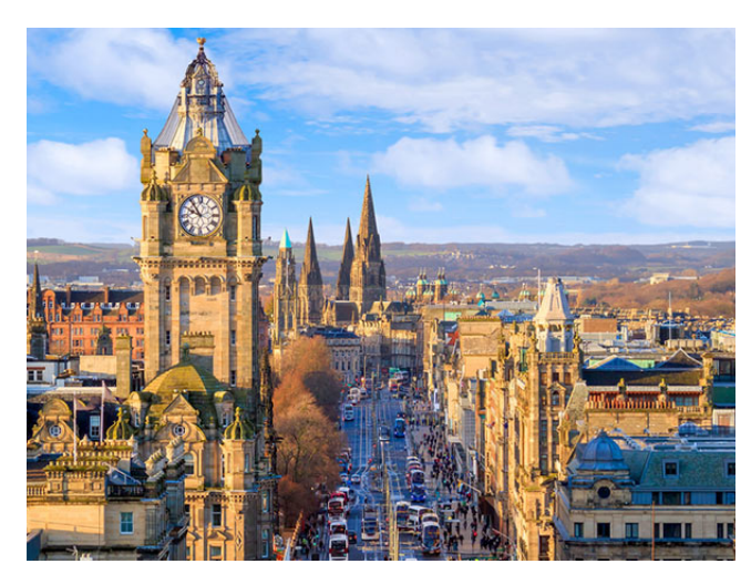
DAY 1: Fly to Edinburgh, Scotland

Today you'll board an overnight flight to Edinburgh, Scotland. Or, depart earlier for your optional pre-trip extension.