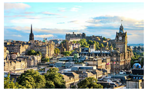
Explore Edinburgh's UNESCO-listed Old and New Towns on a guided tour