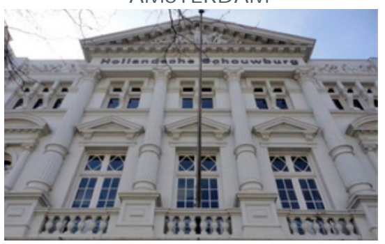
Discover the city's WWII history on a walking tour of the Jewish Quarter