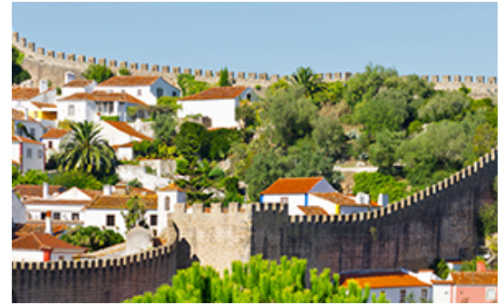
Explore one of Portugal's prettiest towns — once a gift to Queen Isabel from King Dinis