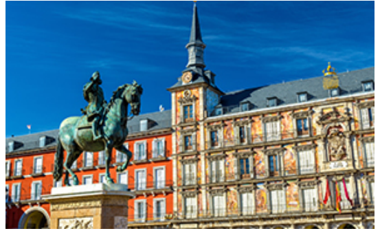
Explore Spain's lively and cosmopolitan capital on panoramic and walking tours