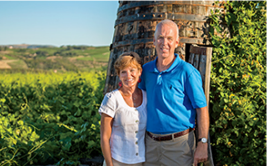
Meet the winery host and uncover generations of wine production at this celebrated estate, where you'll enjoy lunch and a tasting