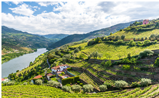
Sip your way through the Douro River Valley, enjoying views of latticed vineyards and visiting quaint towns and wine estates