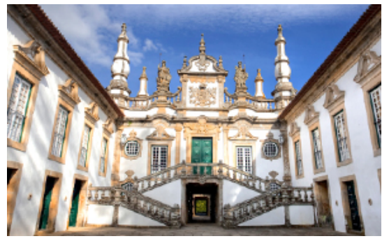
Step into the Old Europe of your imagination at this sprawling estate, complete with stunning and meticulously-maintained gardens