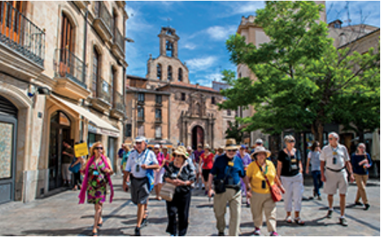
Experience this old city that's young at heart, thanks to thousands of students who attend the local 13thcentury university