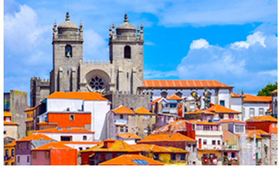
Tour the highlights of Portugal's second-largest city and uncover its mosaic of architectural styles and creative, contemporary vibe