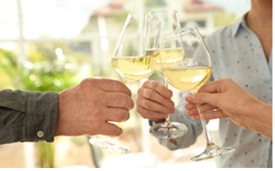
Enjoy fantastic regional wines in breathtaking Douro River Valley settings