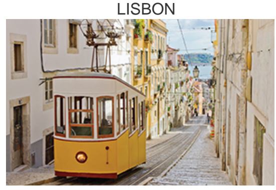
Discover the endless nooks and crannies of UNESCO-listed and cobblestoned Lisbon