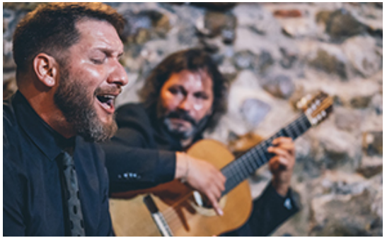
From an onboard fado performance to a flamenco show, delve into the culture of Portugal and Spain throughout your journey