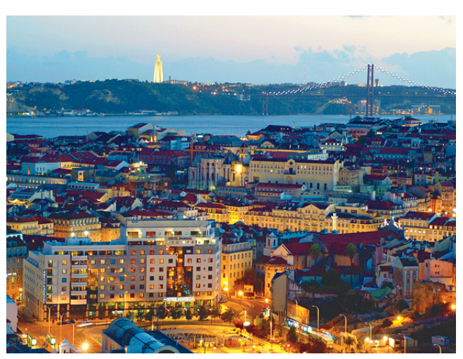
DAY 1: Fly to Portugal

Depart the U.S. and board an overnight flight to Lisbon, Portugal. Or, depart earlier for your pretrip extension to Madeira, Portugal.